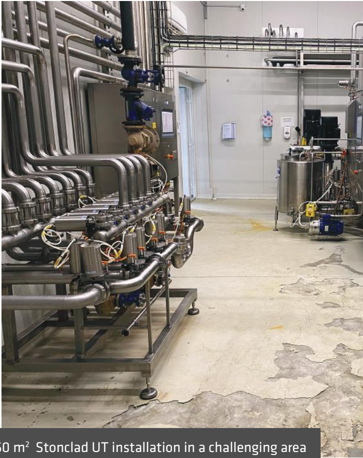
60 m 2 Stonclad UT installation in a challenging area

The Stonhard Difference Stonhard is the unprecedented world leader in manufacturing and installing high-performance polymer floor, wall and lining systems. Stonhard maintains 300 Territory Managers and 175 application crews worldwide who will work with you on design specification, project management, final walk through and service after the sale. Stonhard's single source warranty covers both products and installation.